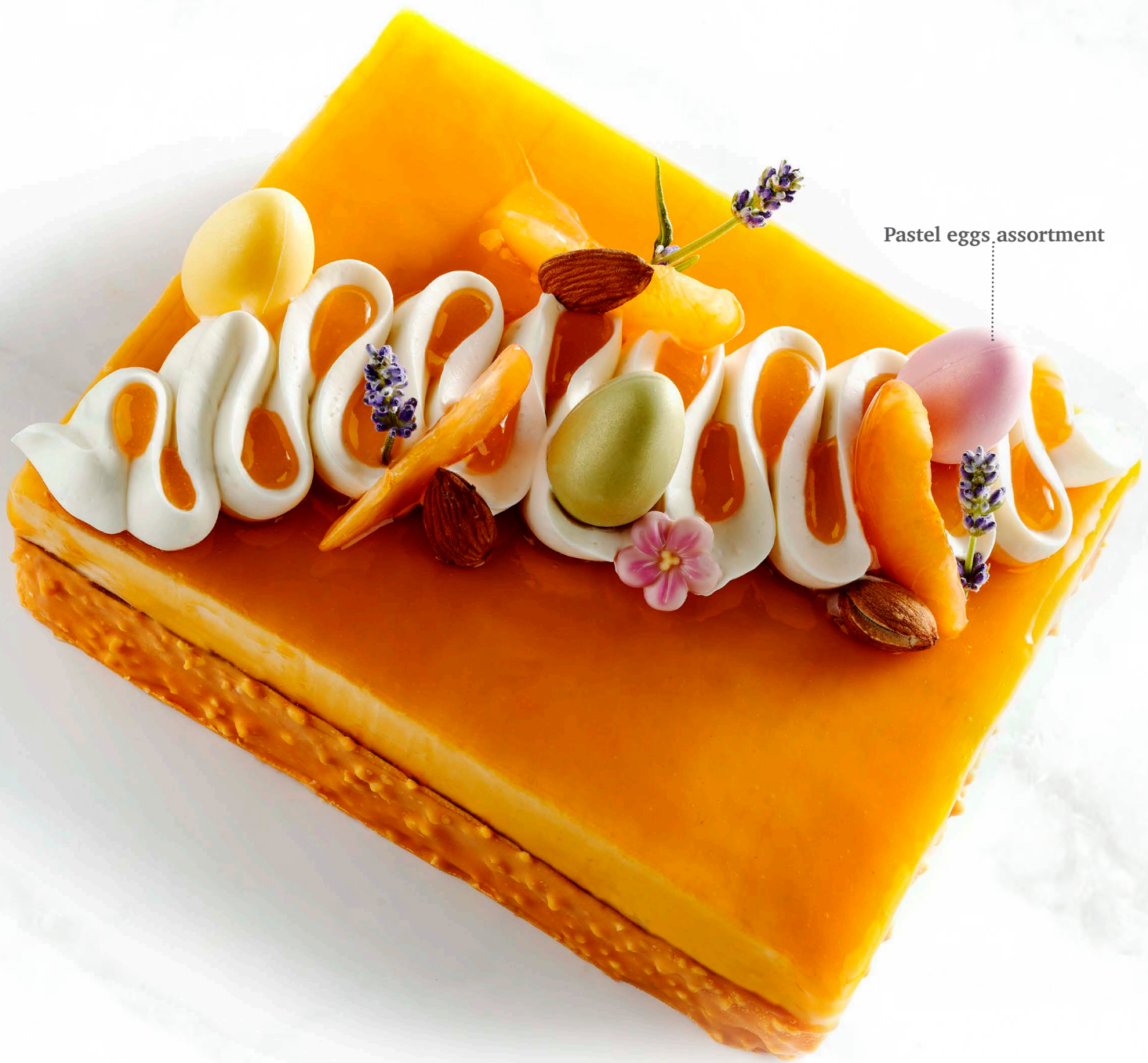
Pastel eggs assortment