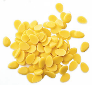
Sprinkle eggs yellow 78316 (0.6 kg)