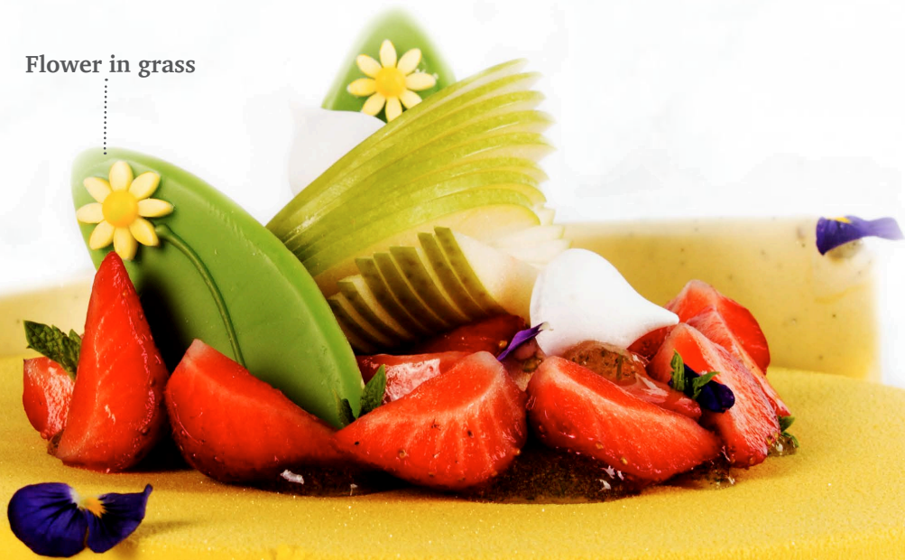
Flower in grass