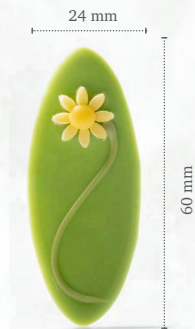
Flower in grass 77766 (112 pcs)