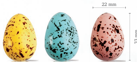
Speckled eggs assortment 77783 (156 pcs)