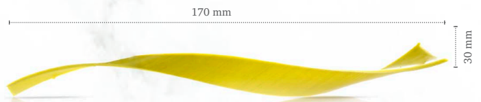
Wave green large 77776 (48 pcs)