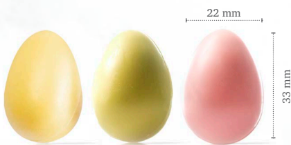
Pastel eggs assortment 77781 (36 pcs)