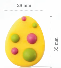
Colored egg mini 77765 (192 pcs)