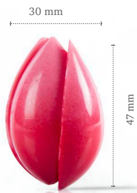
Tulip red 77361 (20 pcs)