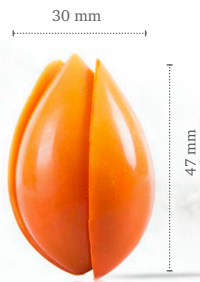
Tulip orange 77360 (20 pcs)