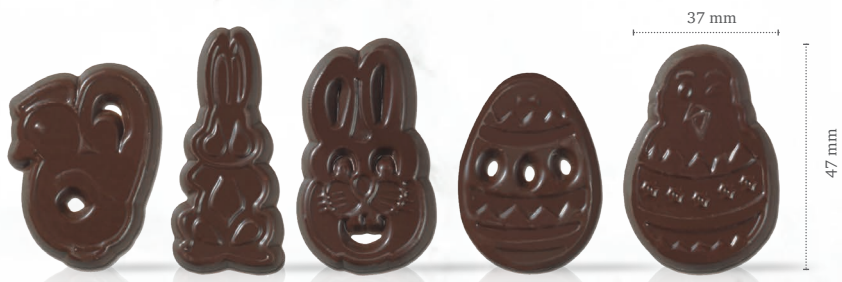
Easter exclusive assortment 71403 (±320 pcs)